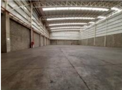
PRIMER PISO ( ÁREA DE BODEGA )