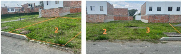
LOTES MANZANA 3