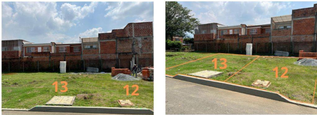
LOTES MANZANA 1