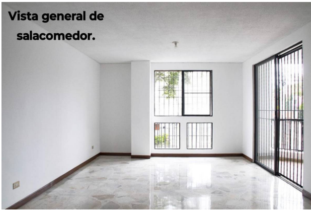
Vista general de salacomedor.