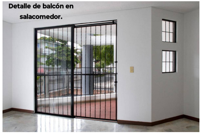
Detalle de balcón en salacomedor.